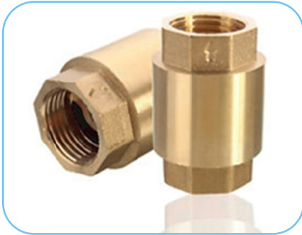
NON RETURN VALVE