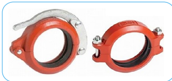
VICTAULIC CLAMPS (BOLT & HANDLE)