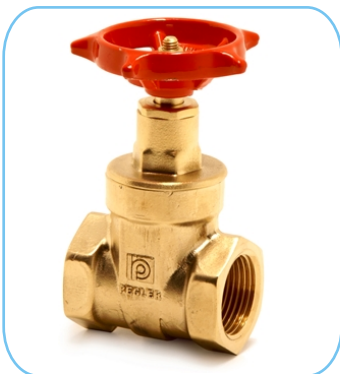
GATE VALVE THREADED