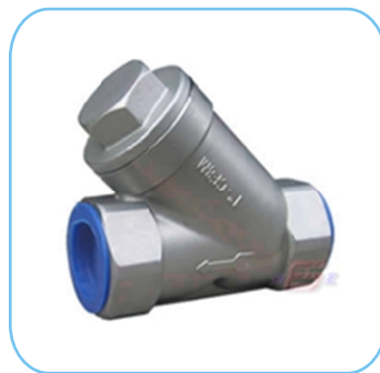
Y - STRAINER STAINLESS STEEL