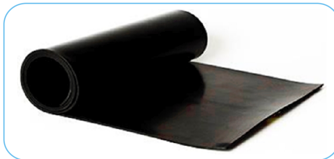
RUBBER SHEETS (NORMAL, NEOPRENE, EPDM)