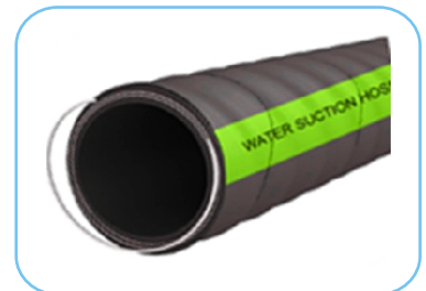
WATER SUCTION HOSES