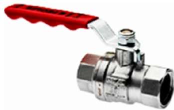
BALL VALVES GALVANIZED