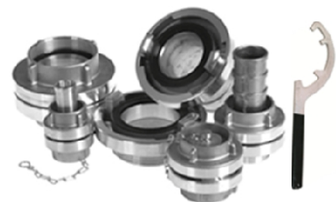
STORZ COUPLINGS & WRENCH