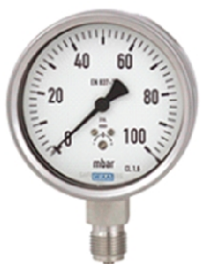
PRESSURE & VACCUM GAUGES