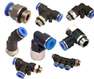
PNEUMATIC CONNECTORS (PLASTIC & STEEL)