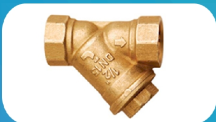
Y - STRAINER BRASS