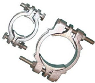
DOUBLE BOLT CLAMP