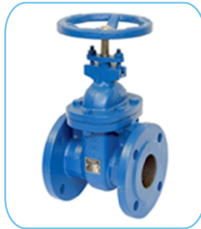
GATE VALVE FLANGED