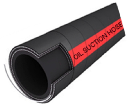
OIL SUCTION HOSES