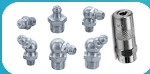
GREASE COUPLER & GREASE NIPPLE